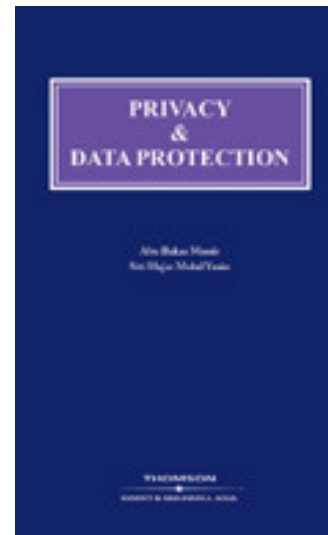
Privacy and Data Protection Sweet & Maxwell (2002)