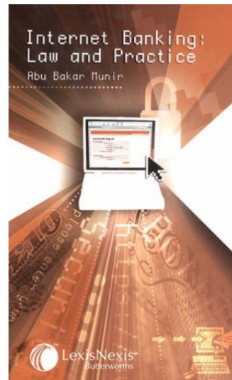
Internet Banking: Law and Practice LexisNexisUK (2004)